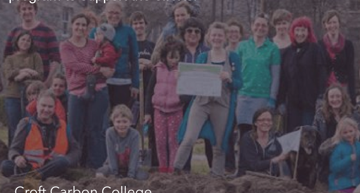
Croft Carbon College, Mine Croft & Edible Schoolyards

Led to lease of the land and eventually funded program to support the efforts.