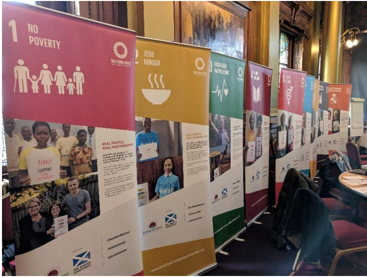
With thanks to Scotland Malawi Partnership for the use of their SDGs display panels